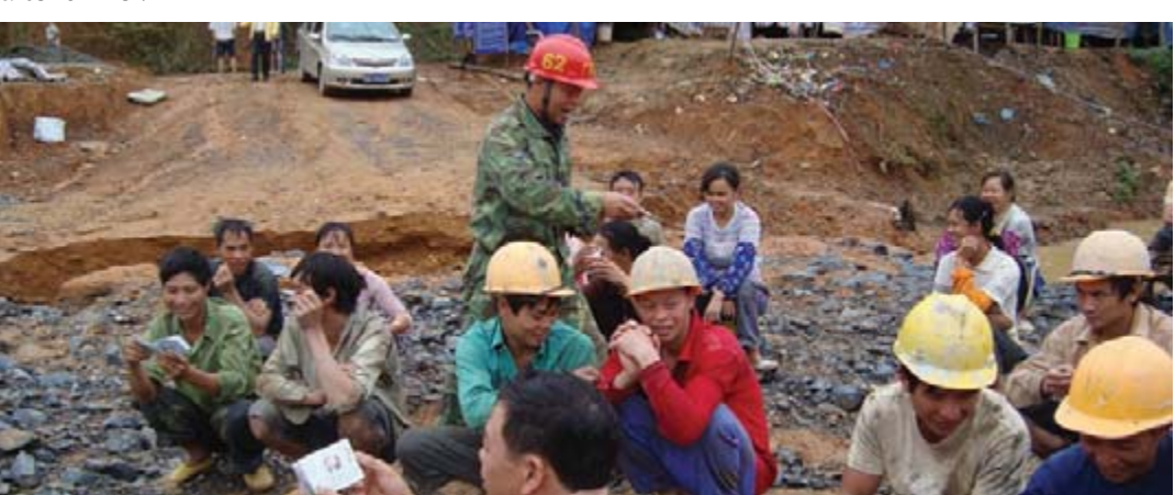
IN BRIEF: There are many short interactive exercises that can be run in an informal setting on construction sites. These allow educators to stimulate discussion on specific issues.